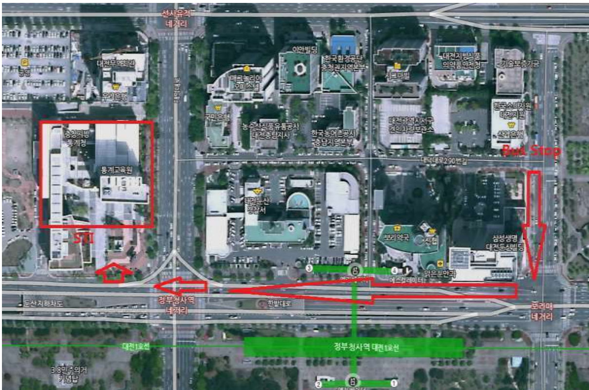
* Address: Statistical Center (Korean pronunciation: Tong-Gye Center, “통계센터” in Korean), 713, Hanbatdaero (282-1, Wolpyung-dong), Seo-gu, Daejeon