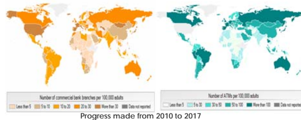
Availability of Commercial Bank Branches and ATMs around the world in 2017