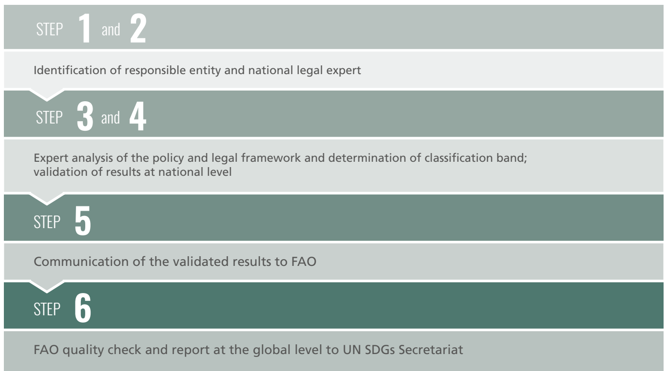
Figure 1: Reporting process under indicator 5.a.2

The results of the assessment and computing will be checked and validated by the responsible entity, prior to communication to FAO. It is recommended that this is a transparent process, open to the participation of civil society and a cross-section of government institutions.