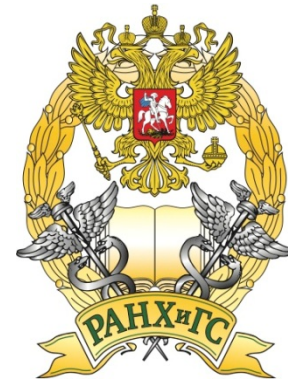
Russian Presidential Academy of National Economy and Public Administration