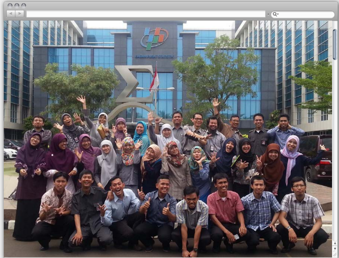
BPS IBR Supervisor and Profiler Team

Sekretariat Integrated Business Register (IBR) Direktorat Pengembangan Metodologi Sensus dan Survei Badan Pusat Statistik RI Jl. Dr. Sutomo No. 6-8 Jakarta 10710 Indonesia