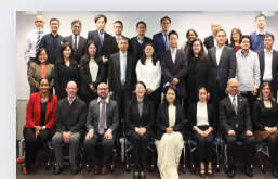
Regional workshop Climate Change Statistics